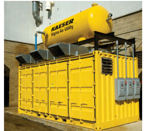
A single container outdoor system.

“Kaeser’s Sigma Air Utility solution ensures we always have compressed air with lower total costs while retaining working capital. We use the Sigma Air Utility at several plants, and the end results have always met or exceeded our expectations. We continue to roll this program out to more facilities.”