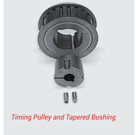
Timing Pulley and Tapered Bushing